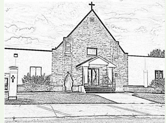
St. Joseph, Wessington Springs Jan. – June Sunday 8:30 AM July – Dec. Sunday 10:30 AM