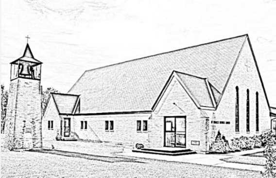
St. Charles, Artesian Saturday 5 PM

The hand of the Lord feeds us; He answers all our needs.